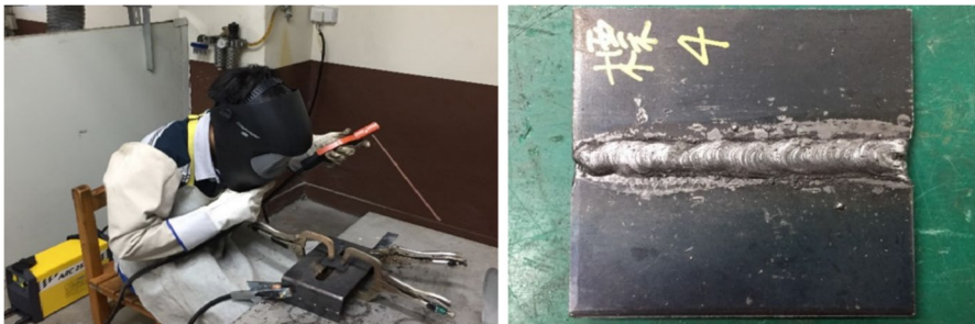
Fig. 2 One participant's practice situation (left) and a sample of a benchmark piece (right)